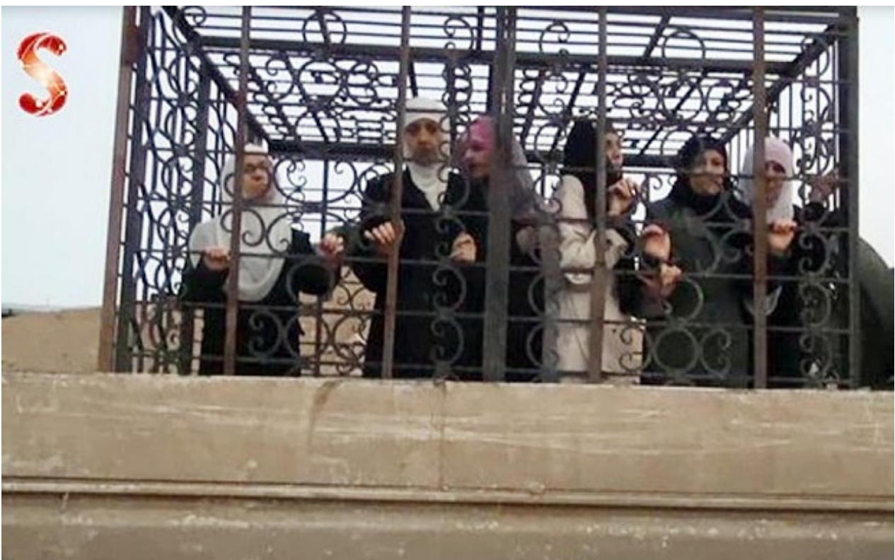
Image: BBC's "US-backed rebel commander" heads a faction that includes the terrorist Jaysh al-Islam faction who caged civilians and used them as human shields outside of Damascus. The US insists that Syria and Russia must negotiate with such organizations and that such organizations should play a role in Syria's future.

It appears, ironically enough, that through the deception of the Western media, al Nusra has been amply assisted in fully hijacking "the struggles of the Syrian people for its own malign purposes."