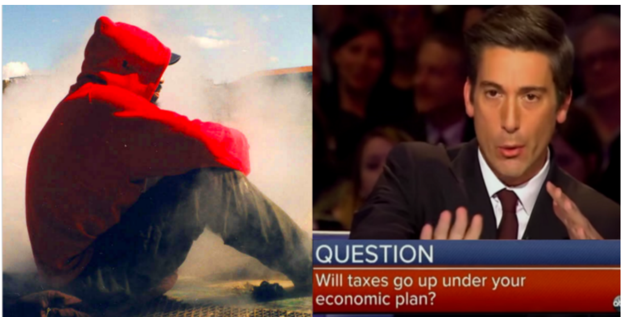
Homeless man on National Mall; ABC's David Muir at December 19

Americans are literally a million times more likely to live in poverty than to have been killed by “jihadi terror” since 9/11: The total figure for the latter is 45 , or about 3 people a year. According to the Washington Post ( 11/23/15 ), the average American is more likely to be killed by home furniture than a terrorist.