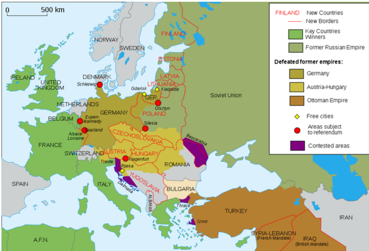
Europe after the Versailles Treaties (Wikipedia)

This map shows how the Ottoman Empire was partitioned: