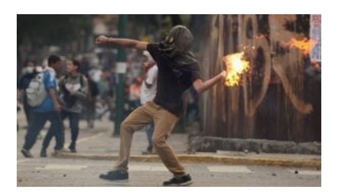
Image on the right: Coup in Venezuela

Today the vast majority of the population of Iraq, Syria and Libya know that they lived far better under previous authoritarian rulers promoting a modernizing, national state then the current conditions under the destructive and savage occupation of western imperialism.