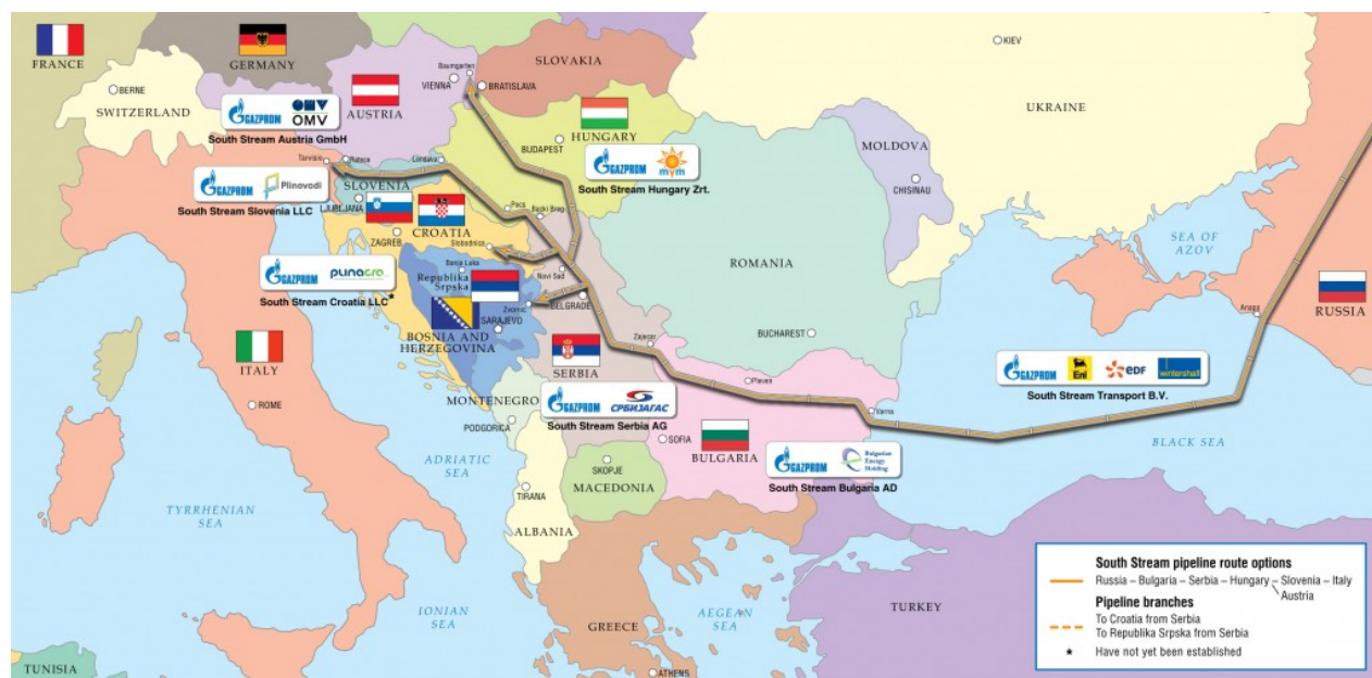
South Stream Pipeline Route Options

On December 1, 2014, President Vladimir Putin announced that the project to build the South Stream gas pipeline "was closed due to the European Union's unconstructive approach to cooperation, including Bulgaria's decision [pressured by the US] to stop the construction of the pipeline's stretch on its territory."