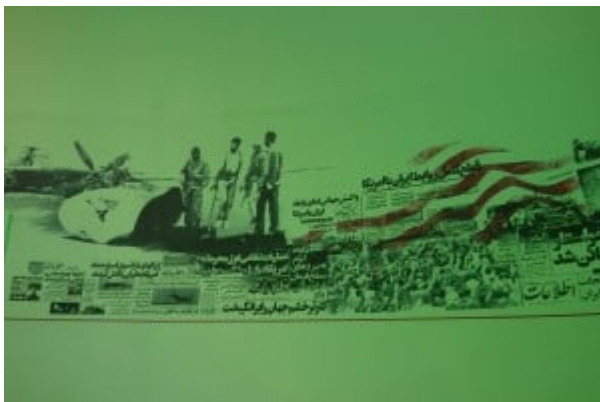
US subversion actions against Iran

At the Conference, ideas were exchanged, and concepts erected. Several speakers described how the West has been supporting extreme, ultra-conservative Islamic teaching - Wahabbism – and used it against the socialist Islam, against countries like Turkey, against several Arab states, against the Soviet Union, China and now against Iran. Ahmadinejad called Wahhabism “a cancer that made the entire Middle East sick.” I also argued that it is also making sick entire Indonesia.