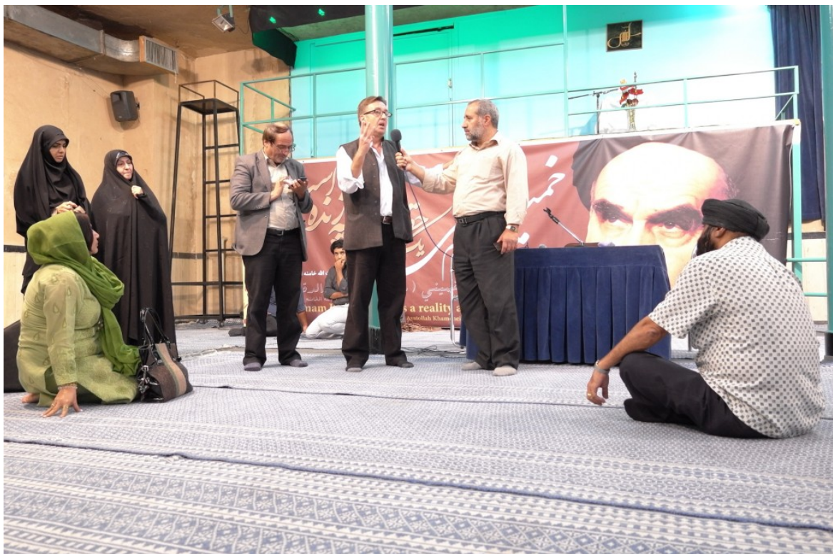
Delegates of the conference interact with local victims of terrorism

I told them about my 1,000-page book “ Exposing Lies of the Empire ”, depicting virtually all corners of the globe that have already been ravished by the West. I spoke about those fascist, fundamentalist doctrines behind such attacks. I told them what I saw, how devastated I have been, but also how determined to resist! And I concluded: