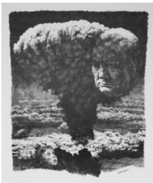
Image on the right: Intaglio print by Sarah Churchill/Curtis Hooper

“No nation, no group of civilized people could take on such a responsibility. The first bomb would be followed by a second, and then humanity would be forced down the road to extinction. Only tribes in the Amazon and the primeval forests of Sumatra would have a chance of survival”.