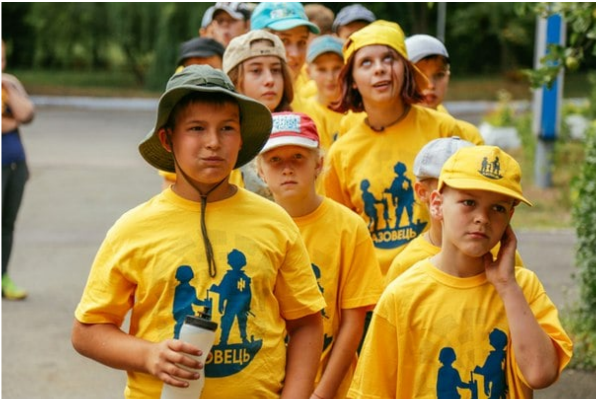
The Nazi Wolfsangel SS symbol on their T-Shirts

The Nazi Summer Camps constitute a crime against Ukrainian children, which the I.C.C., Western governments and the media have casually ignored.