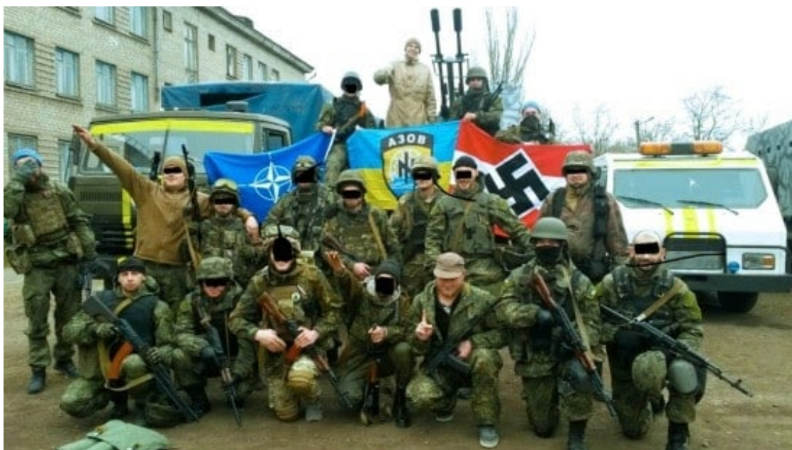
Swastika, Azov Battalion's SS Wolfsangel symbol, NATO Flag (Right to Left)

The Azov Battalion as well as Ukrainian forces have routinely bombed civilians in Donbass since 2014. The I.C.C. fails to acknowledge that killing children in a war zone is a crime against humanity.