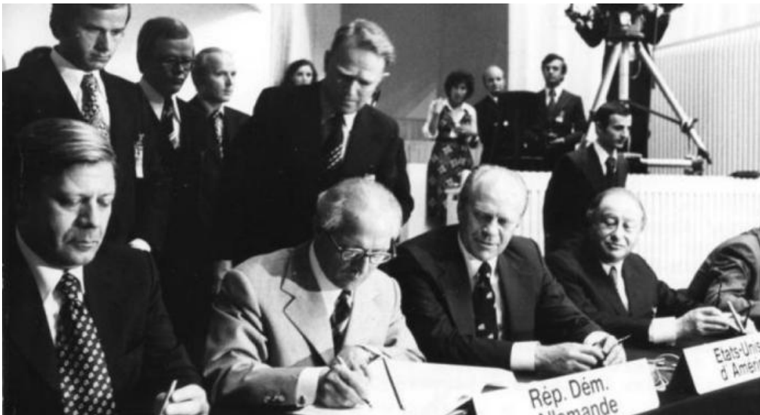
Détente: Left to Right: Helmut Schmidt, Chancellor of the Federal Republic of Germany, Erich Honecker, First Secretary of the Socialist Unity Party of Germany, Gerald Ford President of the United States, Bruno Kreisky, Chancellor of Austria, Helsinki, 1 August 1975.