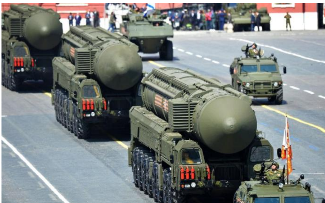
Russia’s nuclear weapons arsenal on display.