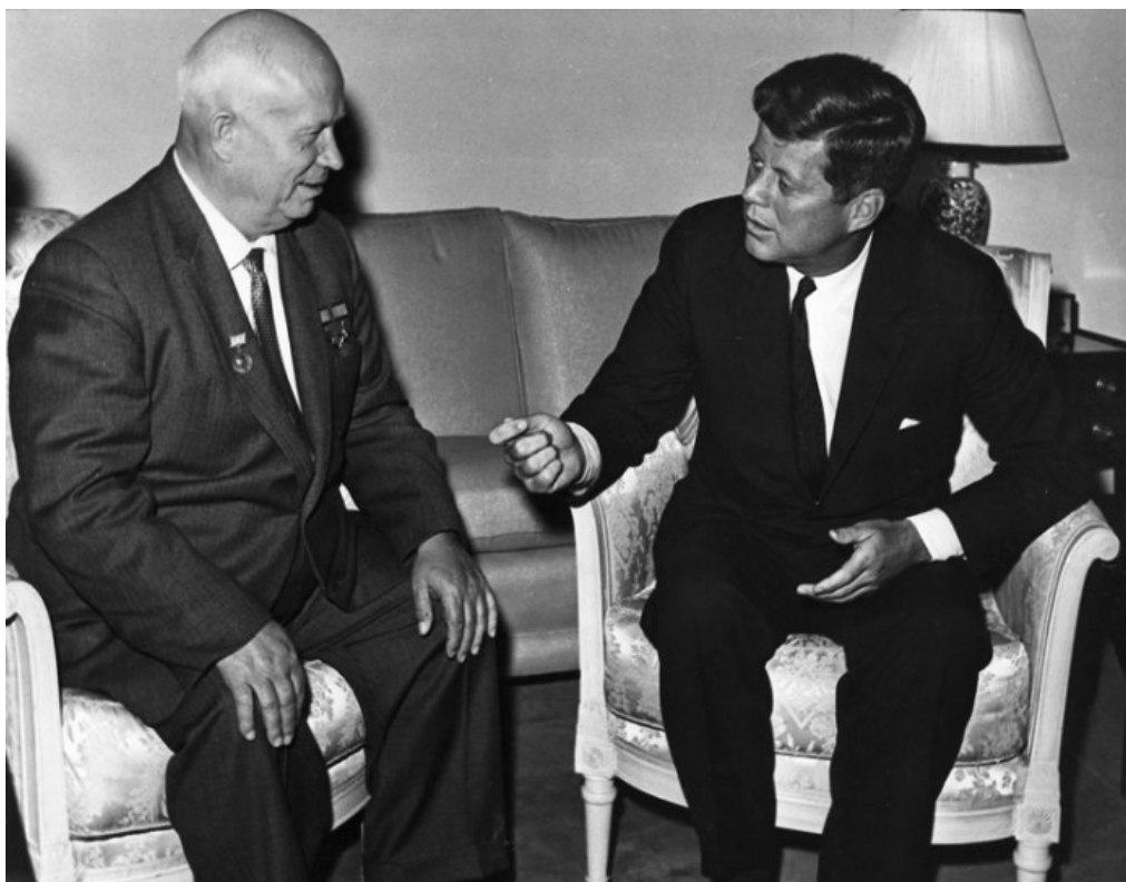
JFK and Nikita Khrushchev meeting at the Vienna Summit in June 1961.