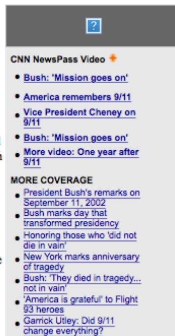
Screenshot of CNN article, September 11, 2001

"The vice president said yes again," remembered Josh Bolton, deputy White House chief of staff. "And the aide then asked a third time. He said, 'Just confirming, sir, authority to engage?' And the vice president -- his voice got a little annoyed then -- said, 'I said yes.'"