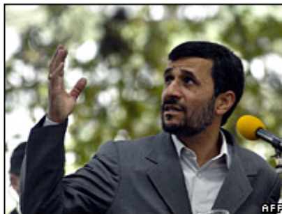
The tool detected changes to a page about Mahmoud Ahmadinejad

Wikipedia Scanner allegedly shows that workers on the agency's computers made edits to the page of Iran's president.