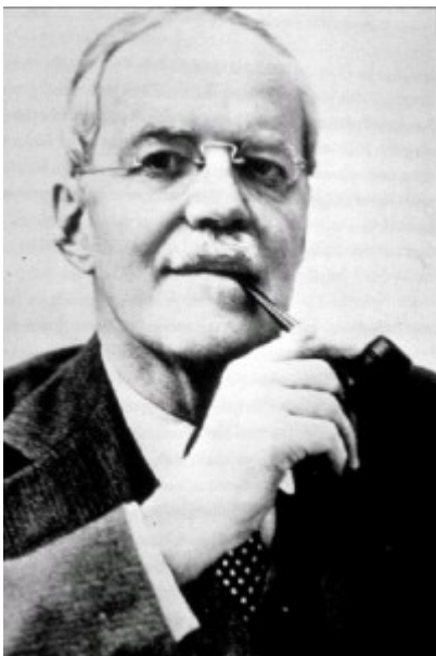
Former CIA Director Allen Dulles

Though the World War II generation has largely passed from the scene and the Cold War ended more than two decades ago, the consequences of Dulles's actions in those final days of World War II are still reverberating in Germany.