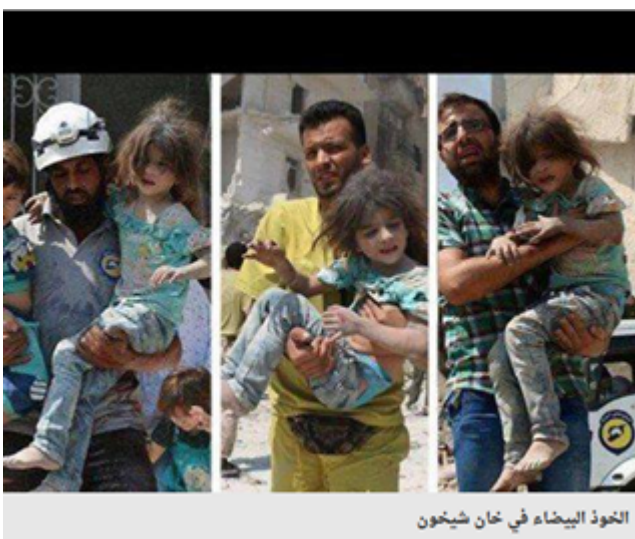
White Helmets in Han-Sheihoun

The videos of the White Helmets where they show their rescue operations have been also repeatedly criticized. In 2017, a number of Arabic mass media cited a Syrian journalist Abbas Juma who published several remarkable screenshots. It turned out that the same children were rescued by the White Helmets several times in the same places. The only possible explanation is that the videos were staged.