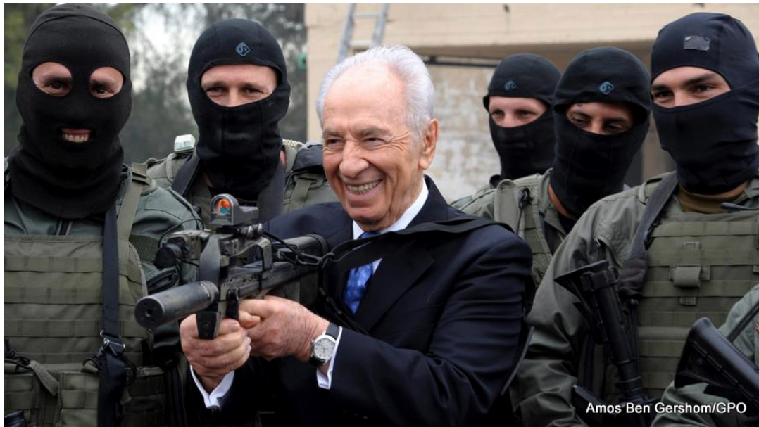
Shimon Peres visits an Israeli police counter-terrorism unit, 2011.

The defense ministry director general traveled extensively to France in those days and cultivated the entire political leadership in pursuit of the necessary agreements to build the Dimona plant. On the very day he flew to France to sign the final deal, the government in Paris fell. Though Ben Gurion saw Peres' trip as wasted, the latter refused to give up. He went to the resigning prime minister and suggested that they back-date the agreement to make it appear as if it had been signed before the resignation. The French leader agreed. And so, Israel's Bomb was saved by an audacious bluff. When someone asked Peres afterward how he thought he could get away with such a stratagem, he joked: "What's 24 hours among friends?"