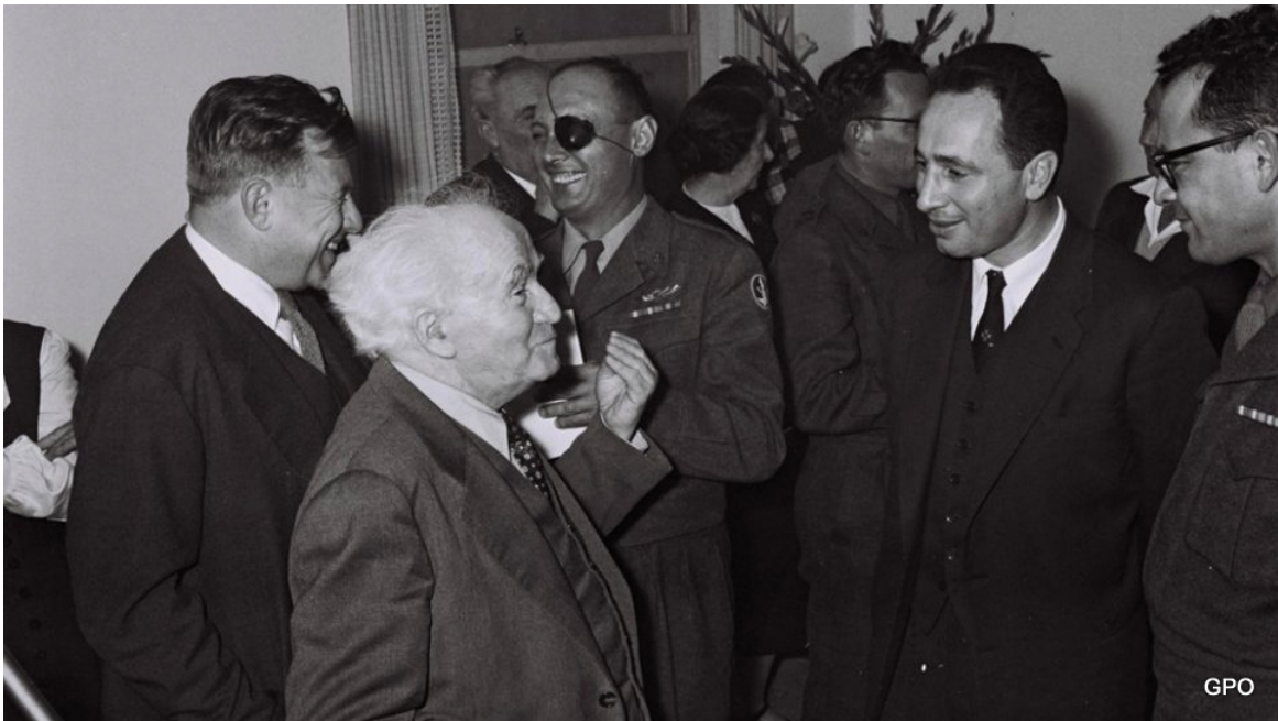
Prime Minister David Ben Gurion with his chief aide, Shimon Peres. In background: defense minister Moshe Dayan and Ben Gurion aide, Teddy Kollek.

So in assessing Peres' legacy it's important to keep this in mind; to separate fact from fiction; myth from reality.