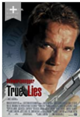
True Lies Additional Crew (1994)