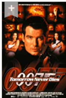
Tomorrow Never Dies Additional Crew (1997)