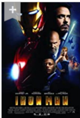
Iron Man Thanks (2008)