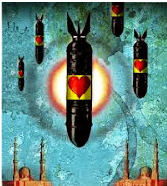
“Humanitarian Aid” Anthony Freda Art

Of course, it should be noted immediately that the conflict in Syria is not so much a civil war but an invasion of foreign forces put together from all over the world and funded by the Anglo-American powers. Moreover, it should also be pointed out that, during the international hysteria over Syria’s chemical weapons stockpile, there has never been even one shred of evidence suggesting that the Syrian government has used chemical weapons against civilians or even against the deaths squads running rampant and inflicting terror upon the Syrian people.