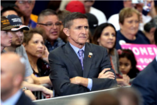
Retired U.S. Army lieutenant general Michael Flynn at a campaign rally for Donald Trump at the Phoenix Convention Center in Phoenix, Arizona. Oct. 29, 2016.

That idea was anathema to the Pentagon and the CIA. Obama's Defense Secretary Ashton Carter had attacked Secretary of State John Kerry's negotiating a Syrian ceasefire that included a provision for coordination of efforts against Islamic State. The official investigation of the U.S. attack on Syrian forces on Sept. 17 turned up evidence that CENTCOM had deliberately targeted the Syrian military sites with the intention of sabotaging the ceasefire agreement.