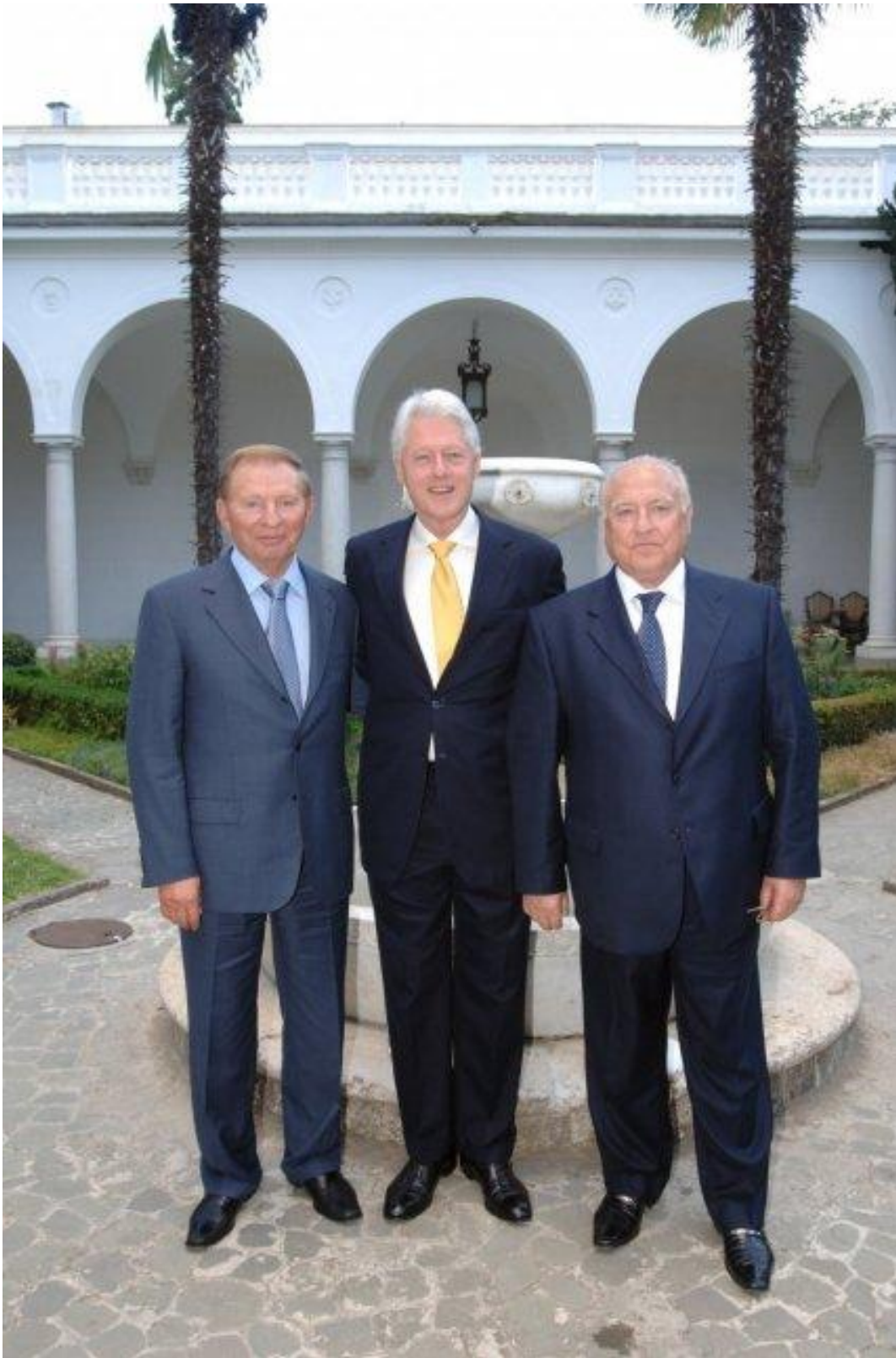
Kravchuk (left) with Bill Clinton in 2007.

Kuchma's attempts to save the ship failed. After constant protests and political pressure, he agreed to step down after the 2004 election, instead putting forth his protégé and Prime Minister, Viktor Yanukovych. It was this election that would begin a nearly 20 year rollercoaster ride of Ukrainian politics, the aftermath of which we can still clearly see today.