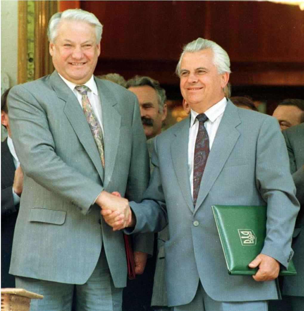
Leonid Kravchuk (right) with Boris Yeltsin.

In the meantime, Crimea was having problems of its own. In 1991, shortly before the fall of the USSR, a referendum passed by a wide margin asking for the return of Crimea's autonomy. The fall of the union made this impossible, so the Crimean parliament voted in 1992 for full independence . This was set to be confirmed via referendum, which the Ukrainian government prevented.