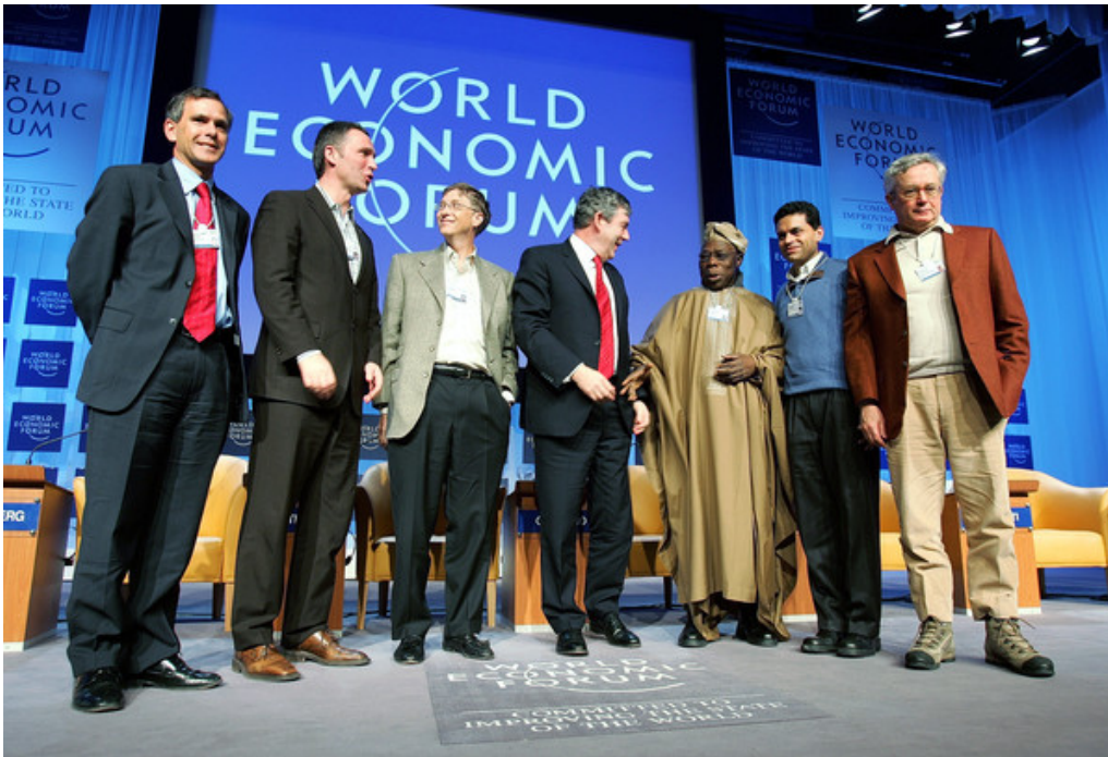
Gates at the 2006 World Economic Forum advising policy makers.

One recent example is the 2021 “High-Level Dialogue on Feeding Africa” that was held on 29-30 April this year. 12 This forum, funded by the Gates Foundation, and organised by a number of Gates Foundation grantees such as the African Development Bank, CGIAR and AGRA, was meant to launch a policy and funding agenda to further push the Green Revolution into Africa. The event attracted no less than 18 African heads of state and several other high-profile personalities. But, most remarkable of all, is that of all the international organisations with activities in Africa on the long speakers list of the dialogue, virtually all are Gates grantees. The forum concluded with a commitment to double agricultural productivity, something AGRA and the Gates Foundation have been promising and failing to deliver for the last decade and a half.