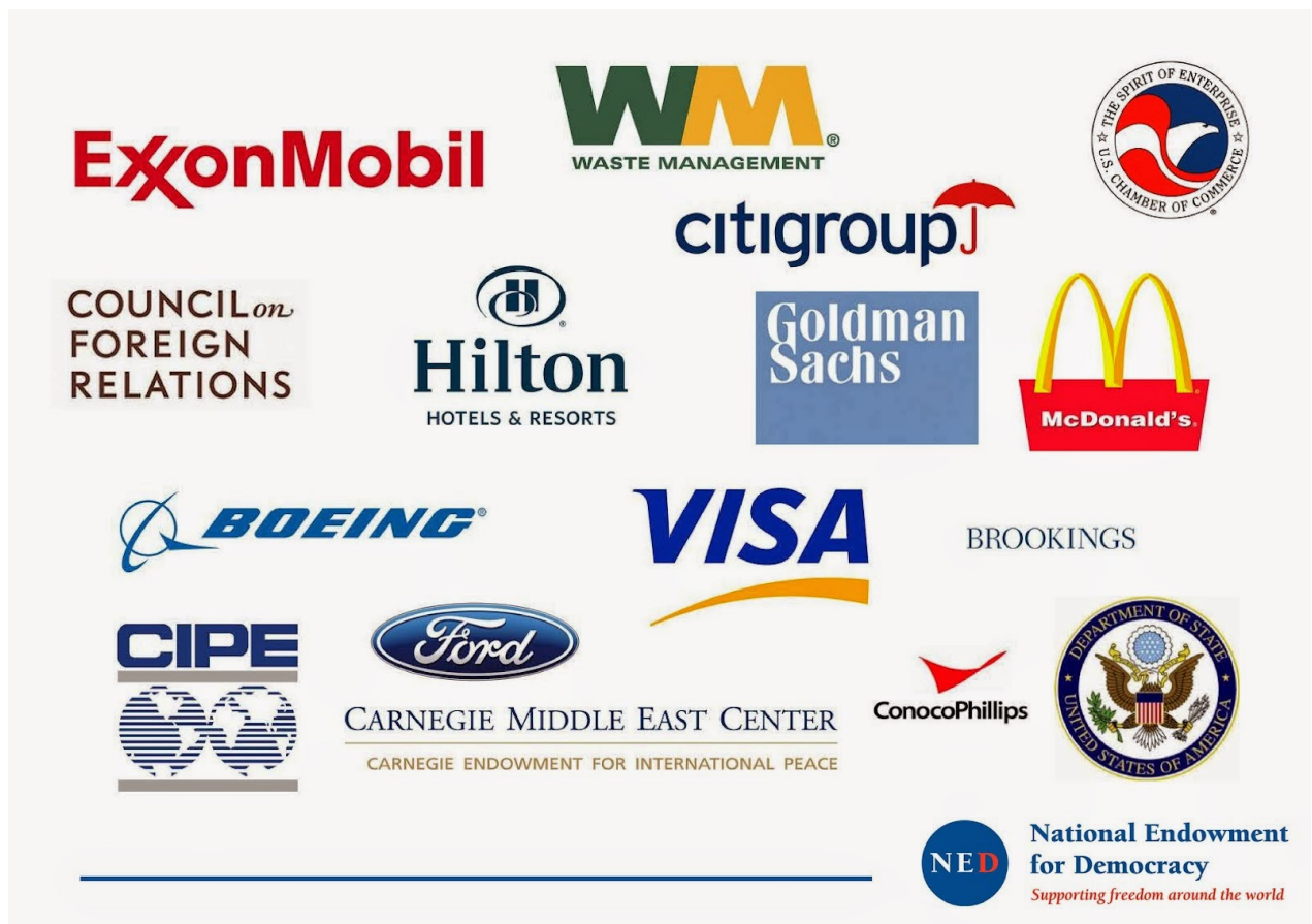
Image: Attempts to claim that the US through NED are simply seeking to “promote democracy” fall short when considering the immense, exploitative, corporate-financier interests represented by NED’s board of directors (pictured above). It is difficult to believe that Boeing, Ford, McDonald’s Exxon, Goldman Sachs, and others care about “democracy” and not simply a new way to sell their global hegemonic ambitions for greater power and wealth.

is somehow still “progress.” It is human to fall, it is human to feel embarrassed, but it is also human to rise above our petty pride and pursue the truth no matter what the personal cost.