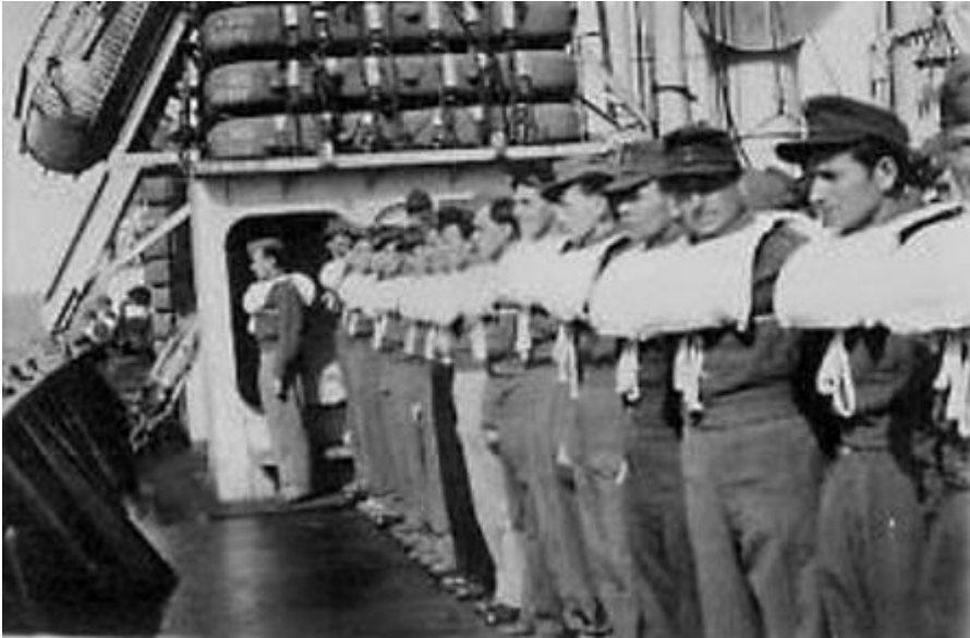
Troops of Galitsia Division being transported to Britain