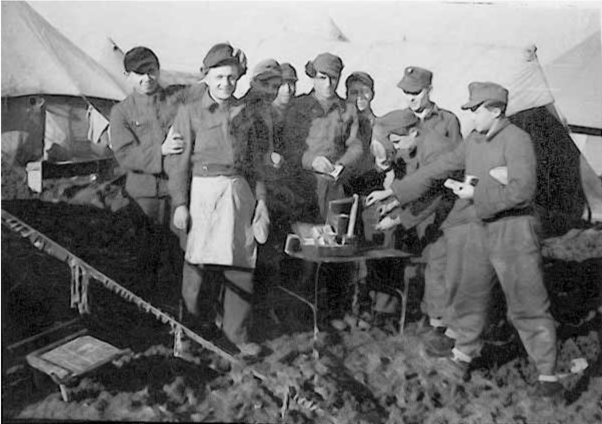
Galitsia Division troops interned at Rimini, Italy