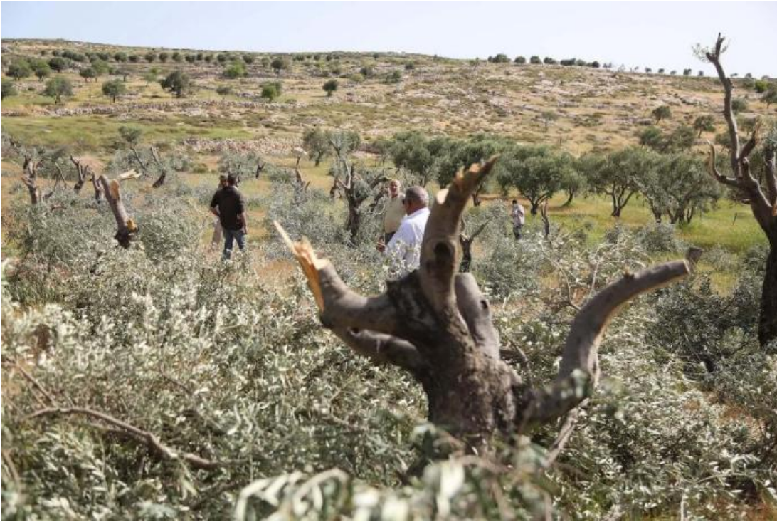
Palestinian farmers inspect the damage done to their olive trees by Israeli settlers.