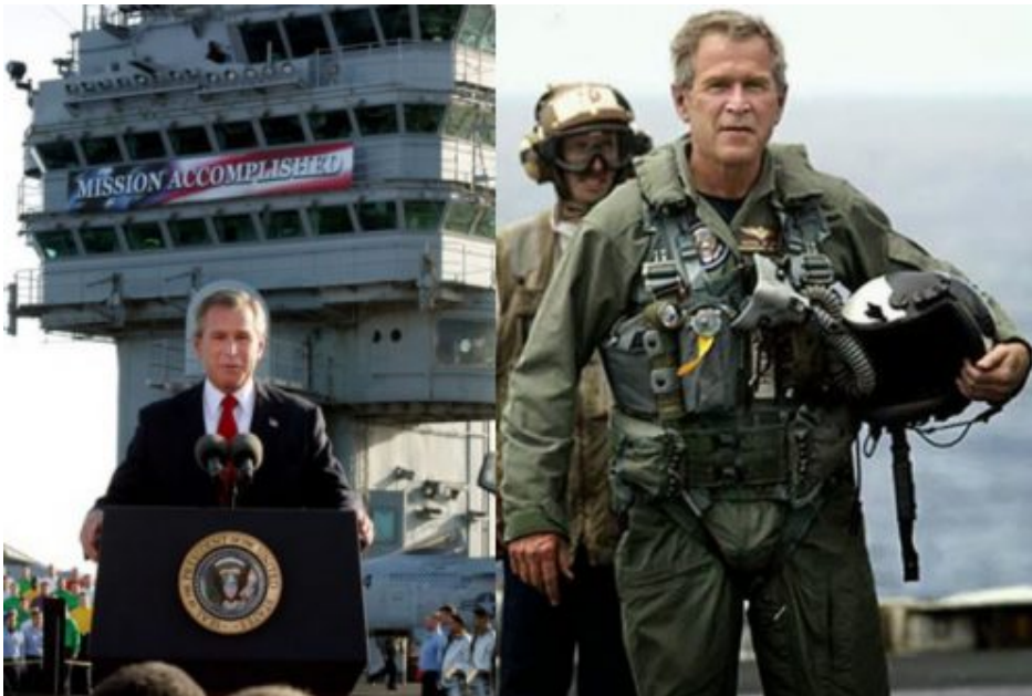
Pubescent Sexual Fantasy: G W Bush, "Mission Accomplished".

Hence the standing policy of the US regime since 1945, since that 6th of August when the Enola Gay — an aircraft so beloved that it has a special exhibition space in the country's premier historical museum — dropped its lethal load, has been to prepare for the great hordes of non-whites at the gates, with fast, fantastic fatality.