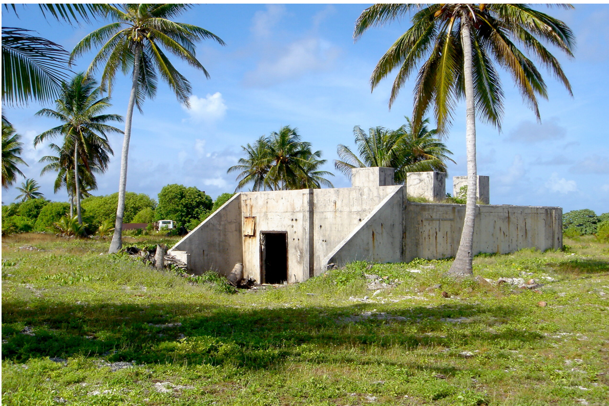
Bikini Atoll Nuclear Test Site Marshall Islands. (UNESCO)

The human and environmental consequences were catastrophic. During the filming of my documentary, The Coming War on China , I chartered a small aircraft and flew to Bikini Atoll in the Marshalls. It was here that the United States exploded the world’s first Hydrogen Bomb. It remains poisoned earth. My shoes registered “unsafe” on my Geiger counter. Palm trees stood in unworldly formations. There were no birds.