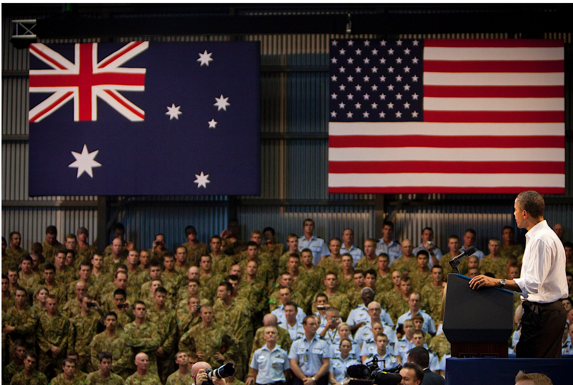
Obama speaks about 60 years of the U.S.-Australian alliance in Darwin, Australia, Nov. 17, 2011.

Whereas Clinton never concealed her warmongering, Obama was a maestro of marketing. “I state clearly and with conviction,” said the new president in 2009, “that America’s commitment is to seek the peace and security of a world without nuclear weapons.”