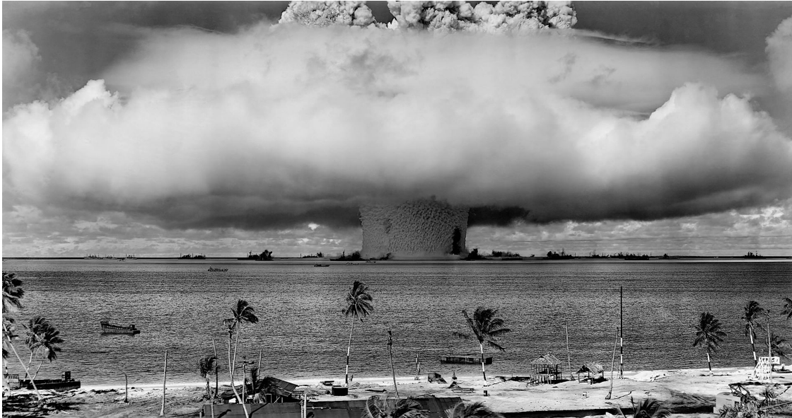
“Baker Shot”, part of Operation Crossroads, a U.S. nuclear test at Bikini Atoll in 1946.

I have reported from five nuclear “ground zeros” throughout the world — in Japan, the Marshall Islands, Nevada, Polynesia and Maralinga in Australia. Even more than my experience as a war correspondent, this has taught me about the ruthlessness and immorality of great power: that is, imperial power, whose cynicism is the true enemy of humanity.