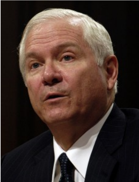
Former CIA Director (and later Defense Secretary) Robert Gates.

Indeed, for thoughtful and/or progressive Democrats, the prospect of a President Hillary Clinton could represent a step back from some of President Barack Obama's more innovative foreign policy strategies, particularly his readiness to cooperate with the Russians and Iranians to defuse Middle East tensions and his willingness to face down the Israel Lobby when it is pushing for heightened confrontations and war.