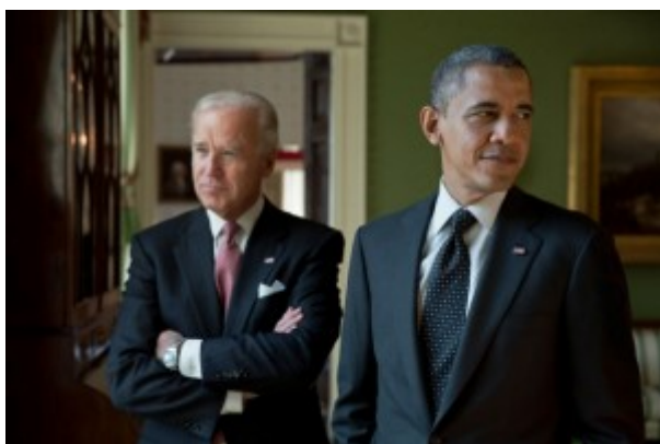
President Barack Obama stands with Vice

In Duty , Gates cited his collaboration with Clinton as crucial to his success in getting Obama to agree to the Afghan troop escalation and the expanded goal of counterinsurgency. Referring to Clinton, Gates wrote, "we would develop a very strong partnership, in part because it turned out we agreed on almost every important issue."