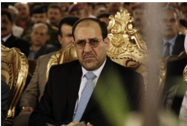
Iraqi Prime Minister Nouri al-Maliki.

Radical Shiite leader Moktada al-Sadr also helped by issuing a unilateral cease-fire, reportedly at the urging of his patrons in Iran who were interested in cooling down regional tensions and speeding up the U.S. withdrawal. By 2008, another factor in the declining violence was the growing awareness among Iraqis that the U.S. military's occupation indeed was coming to an end. Prime Minister Nouri al-Maliki insisted on – and got – a firm timetable for American withdrawal from Bush.