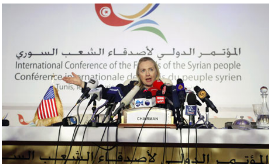
Image: US Secretary of State Hillary Clinton has attempted on numerous occasions to leverage fabricated atrocities to stampede UN resolutions through the Security Council to allow the same destructive, tragic military campaign against Syria that was waged against Libya. Her latest outburst was so overtly fraudulent and patently false, her continuation as Secretary of State risks a permanent and exponentially accelerating decline in US legitimacy worldwide.

Cites false reports regarding Syria "massacre" to call for UN Chapter 7. Irresponsible warmongering leaves American credibility irrevocably damaged.