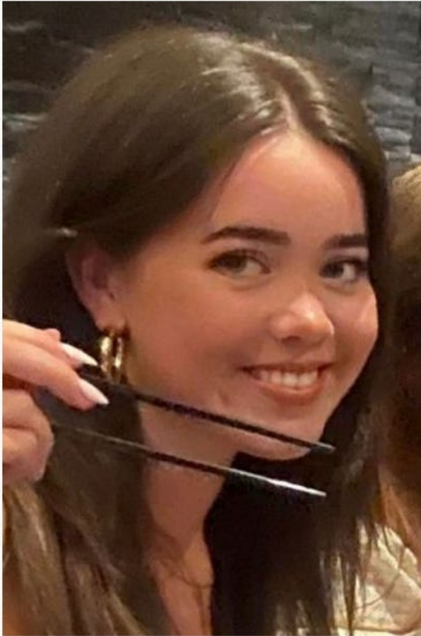
She had spent the day travelling on an electric bike through the French capital