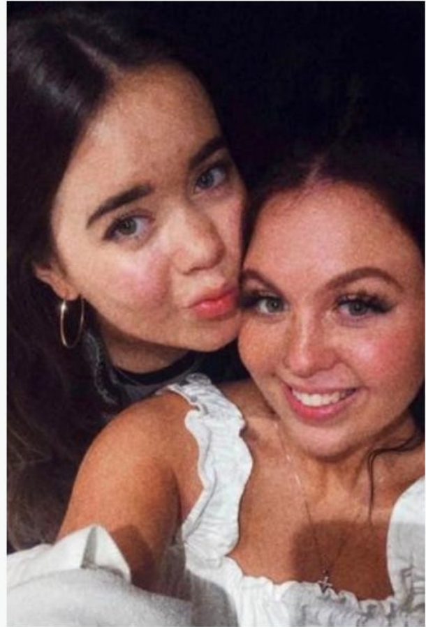
The Birmingham teen, left, had spent the day travelling in Paris