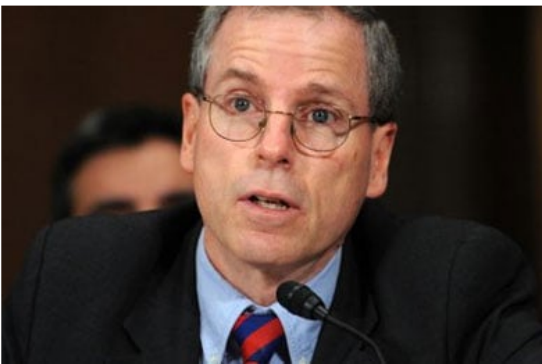
Robert S. Ford, outgoing US Ambassador to Syria