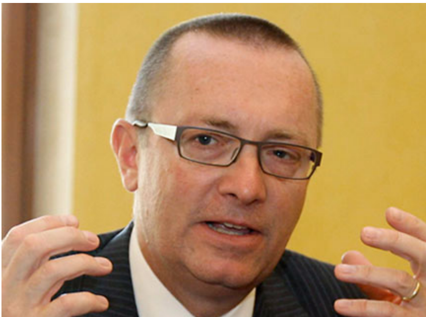
Assistant Secretary of State for Near Eastern Affairs Jeffrey Feltman

Frederic C. Hof, Robert Stephen Ford and Jeffrey Feltman are the State Department's key Syria policy-makers, with close links to the Syrian Free Army (SFA) and the Syrian National Council (SNC).