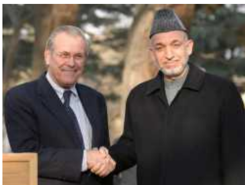
Rumsfeld and “elected” President Karzai

Rumsfeld retired, but the disastrous Iraq and NATO ‘plans’ roll on unobstructed, with a little help from Rumsfeld’s UN-Nato ally, Victoria Nuland, (US Permanent Representative to NATO)