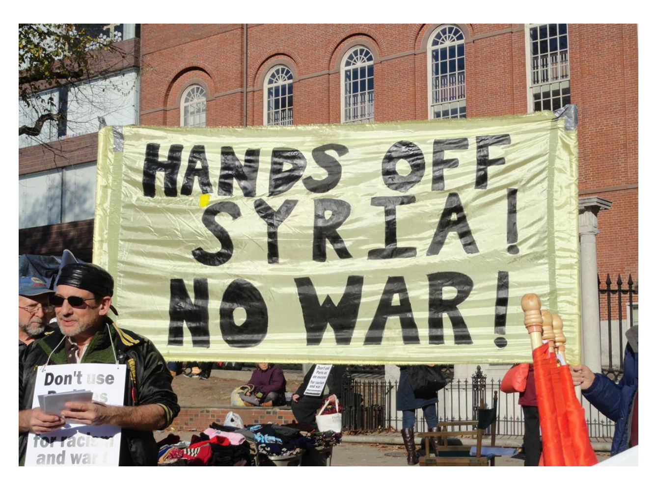
Image: Boston Anti-War Protest: 'Hands Off Syria! No War! Nov. 21 2016