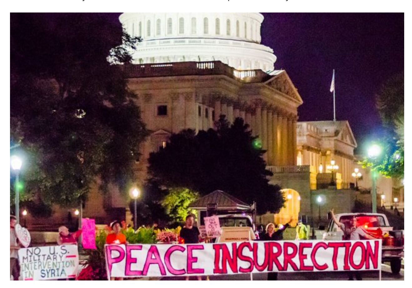
Image: Peace Insurrection on Capitol Hill 2013, CODE PINK.

President Trump announced withdrawal from Syria this week. This creates an opportunity to end the war on Syria. We have work to do to make peace a reality.