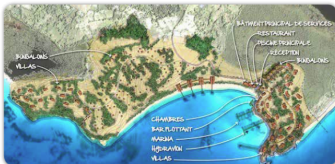
Photo of part of plans for Phase I of the Haitian government's Ile à Vache tourism project – Expansion of Abaka Bay, one of two of the current luxury hotels on the island.

The community sees it very differently. A grassroots group, Collective for Île-à-Vache (KOPI) [Konbit Oganizasyon Peyizan Ilavach], was formed in December 2013 and immediately began organizing multiple peaceful protests, strengthening the voices of the local community, and connecting with allies.