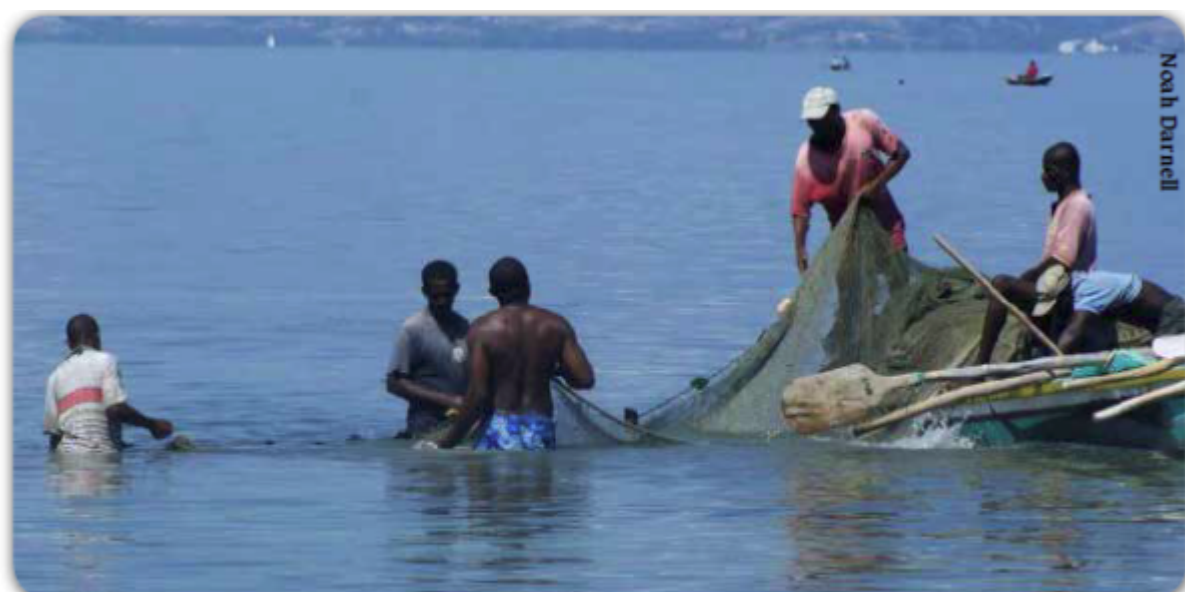
Ile à Vache fisherman. Will the Haitian government's tourism project drive many farmers and fishers from the island into Haiti's shantytowns?