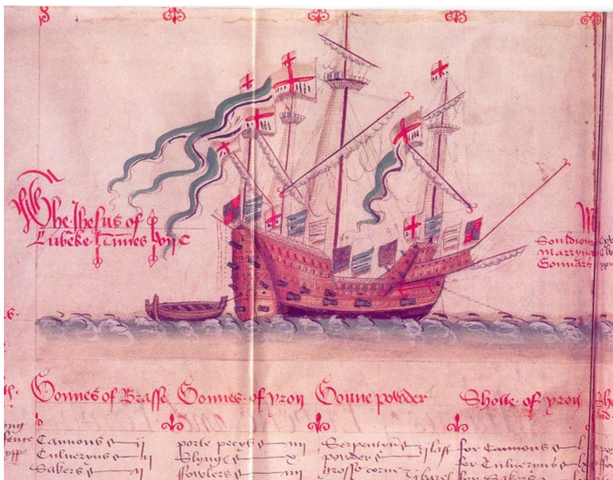
The Jesus of Lubeck – Slave Ship provided by Queen Elizabeth I to John Hawkins .

placed, and the kingdoms, dukedoms, principalities, dominions, possessions, and all movable and immovable goods whatsoever held and possessed by them and to reduce their persons to perpetual slavery, and to apply and appropriate to himself and his successors the kingdoms, dukedoms, counties, principalities, dominions, possessions, and goods, and to convert them to his and their use and profit”.