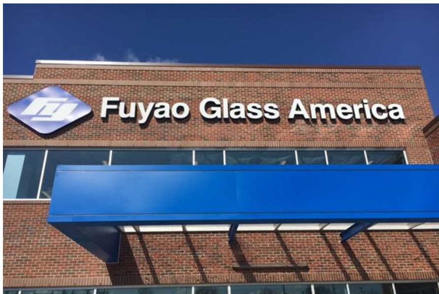
Fuyao Glass America