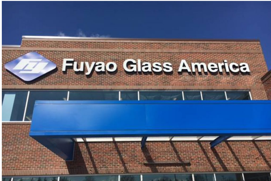
Fuyao Glass America