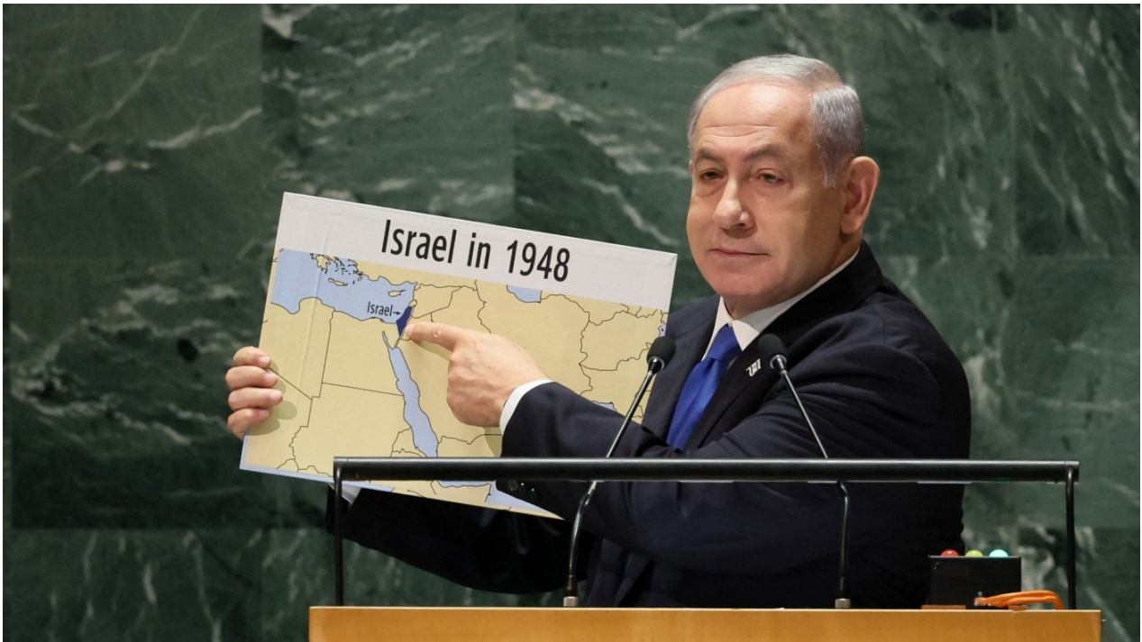
Israeli Prime Minister Benjamin Netanyahu holds up a map showing the occupied West Bank and Gaza as part of Israel during his speech at the UN General Assembly, 22 September 2023

For a number of reasons, however, the explosion of the events of 7 Oct. onto the world scene stands as a telling example of Zionism as a unique genre of harm-creating ideology. An indicator and driver of Zionism's malevolent power is the imposition of many obstructions put in the way of honest and open discussion of its impact on humanity. Zionism is not generally a subject that is open for public exercises in intellectual or philosophical discourse. Zionism, therefore, is an ideology unlike humanity's many other isms .