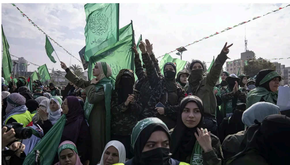
Hamas' military wing