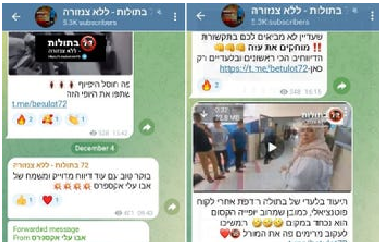
Images from the '72 Virgins - Uncensored' Telegram group.

For years, the IDF has used psychological warfare against Israel's enemies in an effort to undercut their narratives, influence the population (including in the Gaza Strip, Iran and Lebanon) and tout its successes. These campaigns are conducted in secret, using fake accounts, without leaving evidence of IDF involvement. However, the IDF is barred by law from using these capabilities against Israelis.