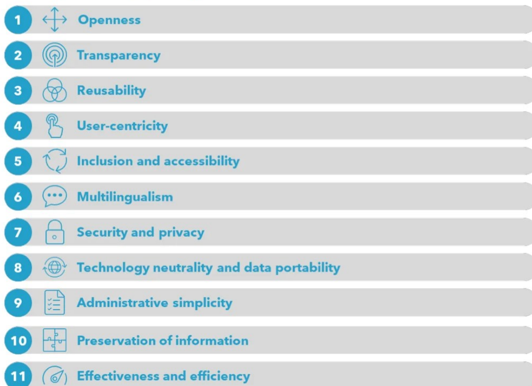
Figure 2 - Digital identity interoperability principles.

As the title of the report indicates, the havoc caused by COVID-19 and the efforts to recover are used as one of the main pretexts for accelerating the usage of digital ID across the globe. The report reinforces this conclusion, stating: