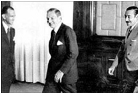
Image: David Rockefeller meets Dictator Jorge Videla (right) and Minister of Finance Martínez de Hoz, 1978?

Behind the massacres and human rights violations, " free market" macro-economic reforms had also been prescribed – this time under the supervision of Argentina's New York creditors, including David Rockefeller who was a friend of the Junta's Minister of Economy José Alfredo Martínez de Hoz. 3