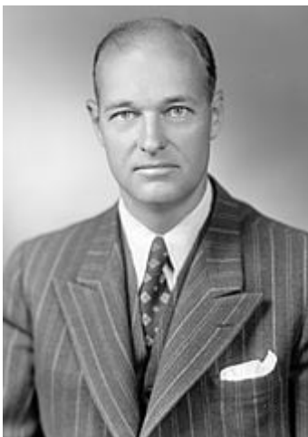
Image: George Kennan

Flashback to George Kennan and the Truman Doctrine in the late 1940s. Kennan believed that the UN provided a useful way to “connect power with morality,” using morality as a