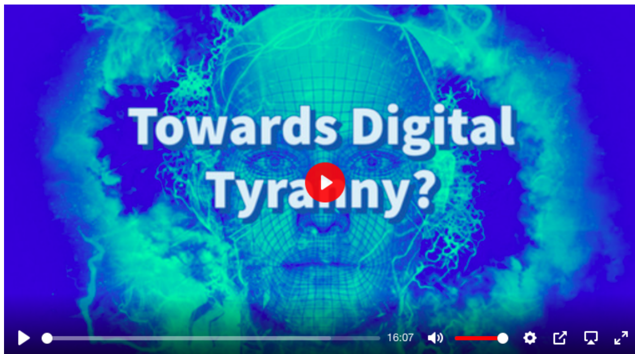
Screenshot from the video