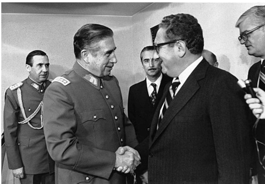
Chilean leader Augusto Pinochet shaking hands with U.S. Secretary of State Henry Kissinger in 1976

In the month following the coup d’etat, the price of bread increased from 11 to 40 escudos overnight . 2 This engineered collapse of both real wages and employment under the Pinochet dictatorship was conducive to a nationwide process of impoverishment.