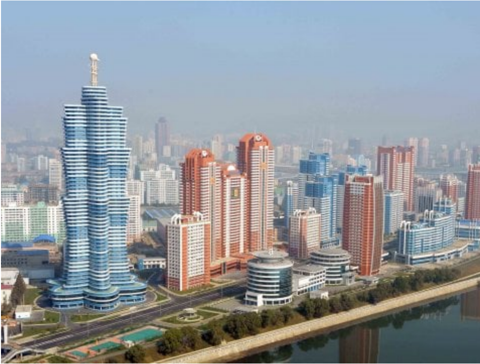
Pyongyang; Compare the towers: Pyongyang vs. NYC

South Korea's Gimpo international airport is barely 2 miles from the border with North Korea.