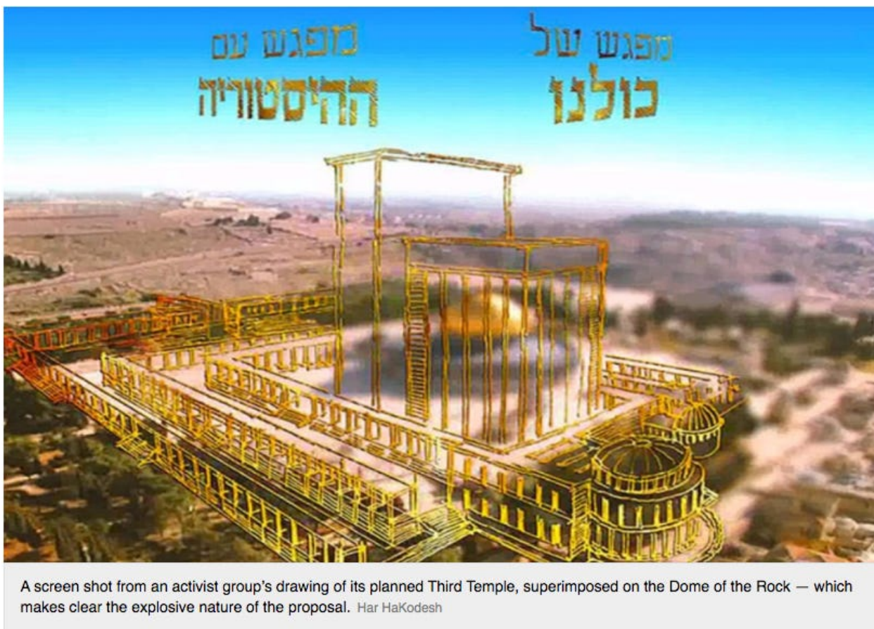
A screen shot from an activist group's drawing of its planned Third Temple, superimposed on the Dome of the Rock — which makes clear the explosive nature of the proposal. Har HaKodesh

The plan to replace the al-Aqsa mosque, which encompasses the Dome of the Rock, has explosive implications. The Dome of the Rock is the thousand-year-old structure that is the oldest in the Islamic world. The Rock under the Dome is where Prophet Muhammed is said to have communed with the spirits of Abraham, Moses, and Jesus before being transported to heaven. Many Islamic groups, including Hamas, have displayed uncompromising resistance to the assertion of Israeli jurisdiction over the site of the large compound of the al-Aqsa mosque. The mosque itself is built around the Dome of the Rock.