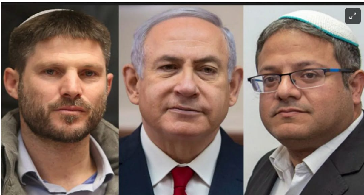
Bezalel Smotrich, Prime Minister Benjamin Netanyahu, and Itamar Ben-Gvir

To understand the possibility of such a drastic response to the Gaza Prison Break, it is important to realize Israel has never been governed by such a radical anti-Arab coalition in its entire history. By allying himself with the likes of Itamar Ben-Gvir and Bezalel Smotich, Netanyahu has entered the realm of the extreme Jewish Supremacist policies proposed by Rabbi Meir Kahane in the 1980s.