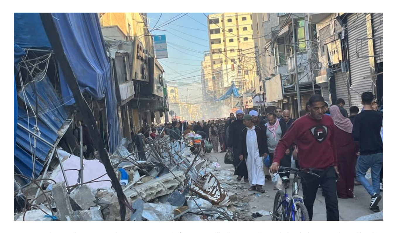
I cannot hear that: nor the screams of the wounded, the cries of the injured, the cries for lost parents, lost children, lost lives; the cries of those trapped under the wreckage of their homes;

I can see the photos: neighbourhoods crumpled and flattened by thousands of bombs; craters where buildings and streets used to be; people, small by comparison to the deluge of destruction, digging with bare hands through the tangled rubble of steel and mortar; people, frozen in time, calling for help, beseeching the world, damning the world, nowhere to turn, no escape from the whistle and rumble of bombs and missiles;