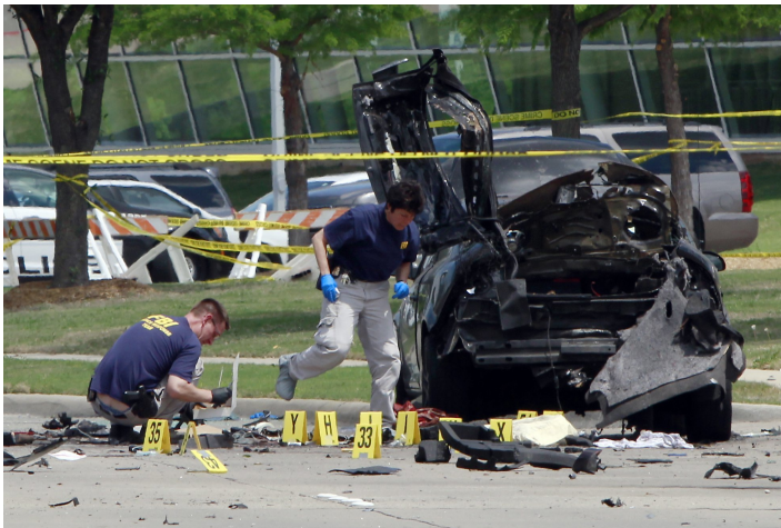
‘Secrets in Garland?’ – What really happened during the apparent 15 second incident at the Curtis Culwell Center in Garland, Texas.

the area – just in case.” Notice how teams organized an evacuation, and not “shelter in place” – more evidence that points to a drill.”