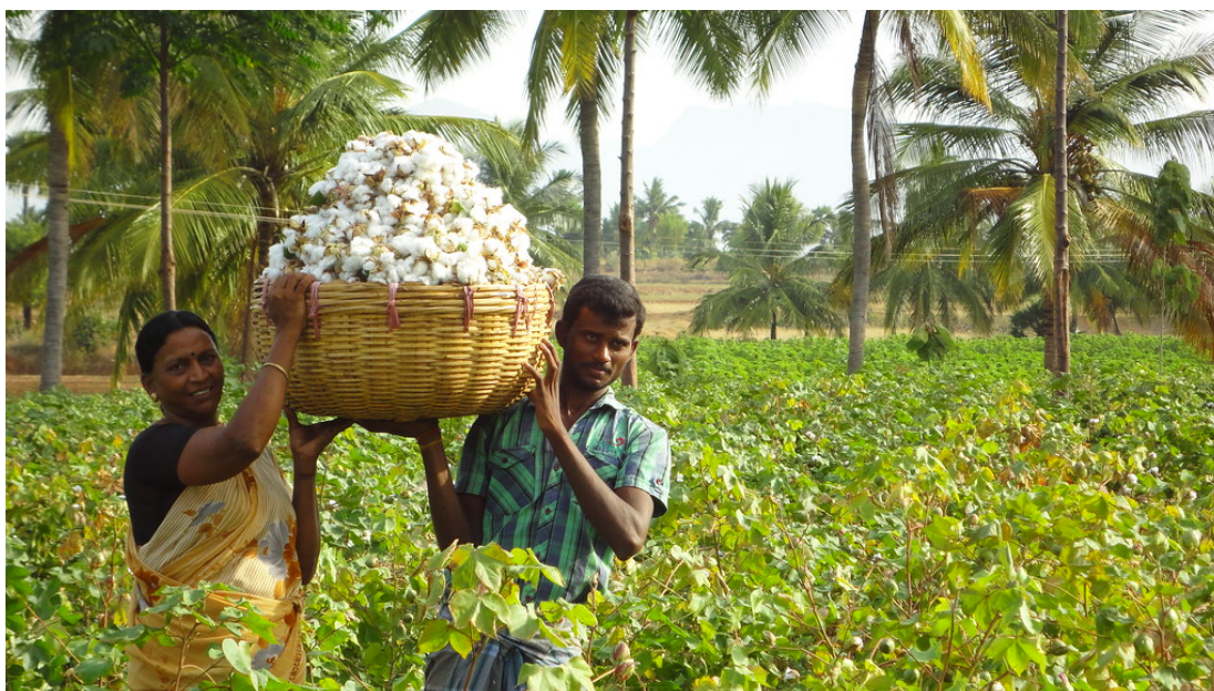
Cotton harvest in India