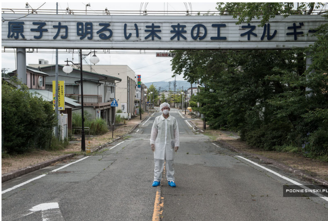
Sign above one of the main streets of Futaba proclaims: "Nuclear power is the energy of a bright future"