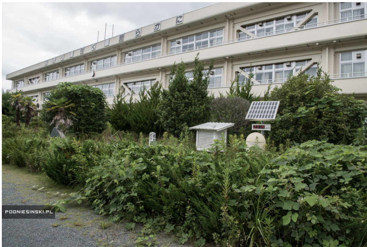
A school in Futaba. A dosimeter showing a radiation level of (2.3 uSv/h).

Tani Kikuyo (age 71) regularly visits the house from which she and her husband Mitsuru were evacuated, but they are permitted to enter only once a month for a few hours at a time. They continue to visit even though they have long ago given up hope of returning permanently. They check to see if the roof is leaking and whether the windows have been damaged by the wind or wild animals. Their main reason for returning however is a sentimental one.