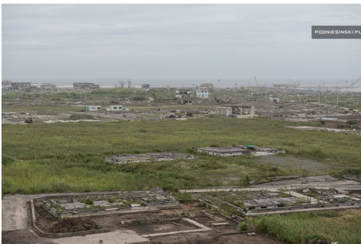
Remains of destruction in the aftermath of the tsunami, seen from the school's observation tower.