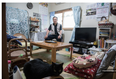
Yoko's husband, Kōchi