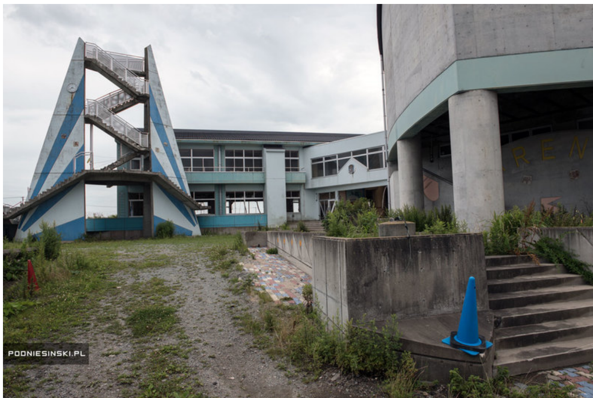
The Ukedo primary school building survived just 300 meters from the ocean.