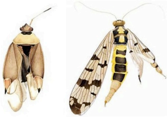
Left: Soft bug (Miridae) from Gösgen, Switzerland ; Right: Scorpion fly (Panorpis Communis) from Reuenthal, Switzerland © Cornelia Hesse-Honegger

Her research suggests that the official ‘low dose event’ category for Chernobyl, and its estimate of 28-32 deaths from acute radiation and 15 subsequent deaths from thyroid cancer is mistaken and should be re-calculated. 47 Of the 16,000 bugs collected until 2007, she found a 30% increase in severe deformities (missing feeler sections, malformed wings, asymmetric body segments, ulcers, black spots, altered pigmentation), 10 times higher than the 1-3% norm. Rather than concentric circles used to measure the distance from the hypocenter as in the model used for Hiroshima, she found topography, wind direction and hydrology as determinants in radiation distribution.