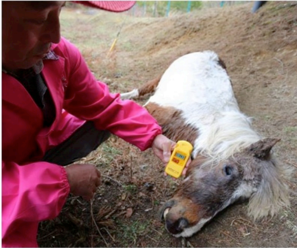
A dead horse at the Hosokawa ranch, 2013

earthworms, leaves and soil from the same area. 52 People are still growing rice in these areas, and are also returning to them. In early July 2013, moss on the roof of a building in Fukushima city 50kms from the NPP returned extremely high Cs137 concentration (1,785,216 Bq/Kg). 53