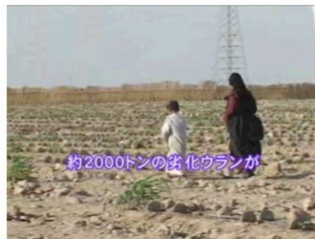
'Approximately 2000 tonnes of DU' – screenshot from Kamanaka Hitomi (dir.), 'Hibakusha: Sekai no owari ni' (Group Gendai Films, 2003)

The documentary showed reports from medical doctors and affected families from 1998 onward of spikes in infant and child leukaemias (acute myeloid leukaemias specific to nuclear radiation) and serious birth defects in Basra and Fallujah, and cases suspected in other locations. They traced the source to depleted uranium munitions (DU) used by US and UK forces in Operation Desert Storm during the first Iraq War (1990–1991). DU is a uranium product derived from enrichment processing of uranium ore, which concentrates the isotope uranium 235 for use in nuclear bombs or nuclear power reactors. The mixture of radioactive waste from this is comprised mostly of U238 (others are Thorium and Proactinium) which has a radioactive half-life of 4.5 billion years. In both the first and second (Operation Enduring Freedom, 2003) Iraq Wars, A-10 Warthog aircraft and armoured ground units (Abrams tanks and Bradley Fighting Vehicles) deployed rounds coated in solid uranium (4,500 grams), which dispersed 300 and 500 tonnes respectively of powderised DU into the local fields and water-ways. 35