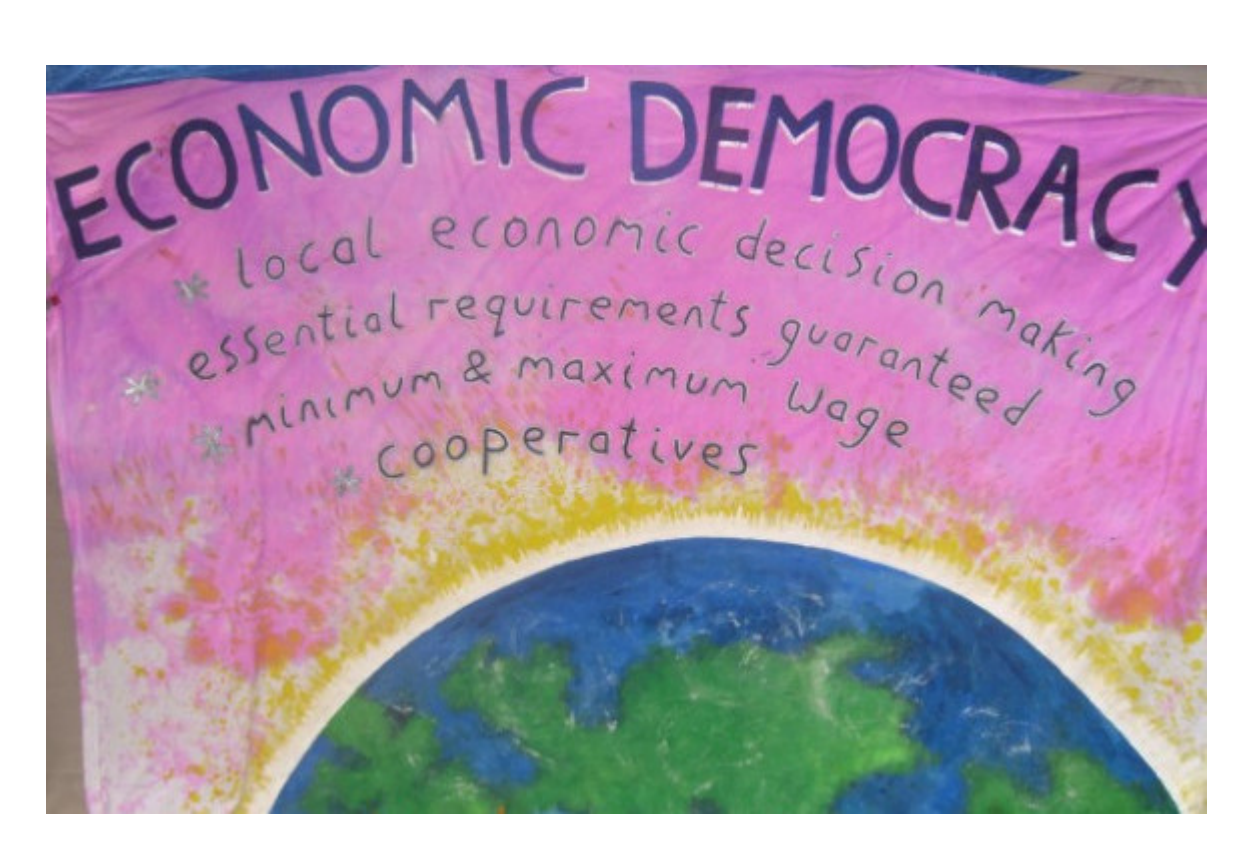
Economic Democracy in response to neoliberalism

In his new book, "Out of the Wreckage: A New Politics for an Age of Crisis," George Monbiot argues that a toxic ideology of greed and self-interest resulting in extreme competition and individualism rules the current economic and political culture. It is built on a misrepresentation of human nature. Evolutionary biology and psychology show that humans are actually supreme altruists and cooperators. Monbiot argues that the economy and government can be radically reorganized from the bottom up, enabling people to take back control and overthrow the forces that have thwarted human ambitions for a more just and equal society.