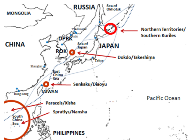
Figure 2: Major Sea Lanes Connecting the Arctic and East Asia, and the Disputed Territories

The increased Arctic Passage marine transportation to Asia would also increase marine traffic near the disputed islands (Northern Territories/Southern Kuriles, Dokdo/Takeshima, Senkaku/Diaoyu, and Spratlys and Paracels) located in the sea lanes connecting the Pacific Ocean, the Sea of Okhotsk, the Sea of Japan (East Sea), the East China Sea, and the South China Sea. This might motivate the concerned states to effectively manage and even to reach some settlement in their territorial and maritime border disputes.