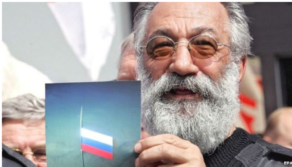
Artur Chilingarov , head of Russian expedition to the Arctic-2007, shows picture of Russian flag in the seabed below the North Pole in August 2007.

In recent years, Russia has become active in its military activities in the Arctic Ocean, protecting its rights to seabed resources, controlling the Northeast Passage to prevent foreign intervention, and defending the sea lane to East Asia (OPRF 2012). A statement of principles, approved by then Russian President Dmitry Medvedev in 2008, regards the Arctic as a strategic resource base of primary importance to Russia. Foreseeing the possible rise of tensions developing into military conflict, the document prescribes “building groupings of conventional forces in the Arctic zone capable of providing military security in different militarypolitical conditions” ( Rossiyskaya Gazeta 2009).