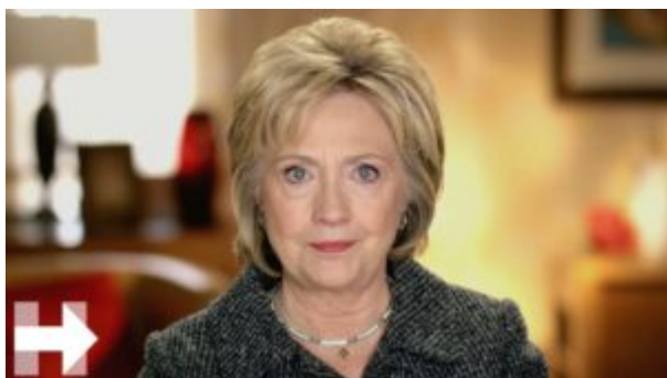
Former Secretary of State Hillary Clinton.

Another problem with the U.S. intelligence community's assessment is that the forensics were left to private contractors working for the Democrats, not conducted independently by U.S. government experts.