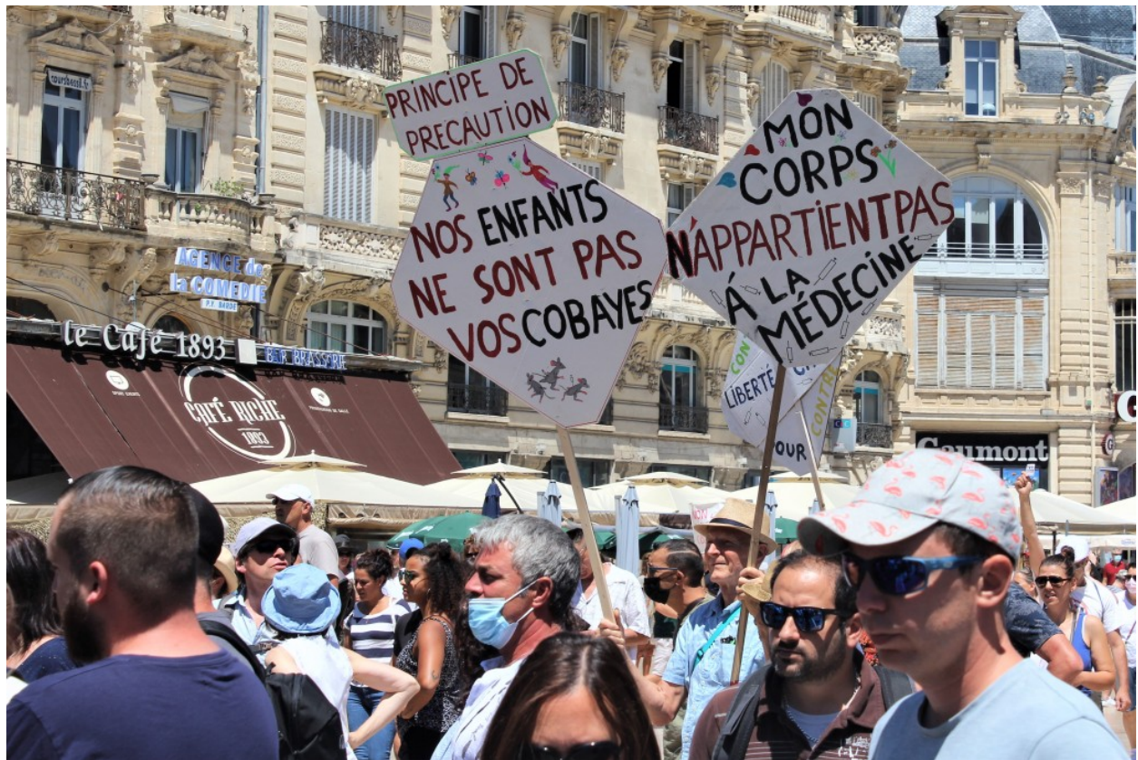
"Our children are not guinea pigs" "My body does not belong to medicine"