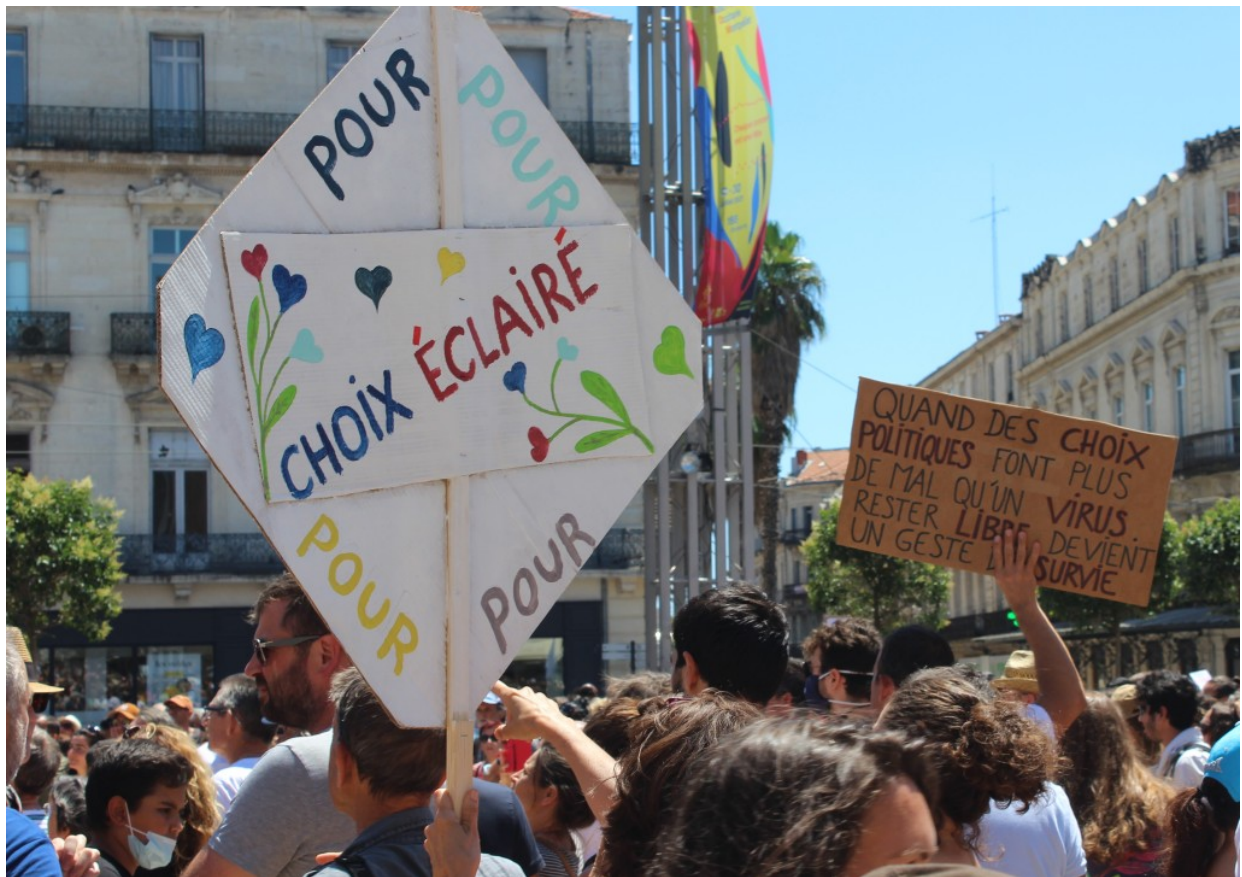
For enlightened choice