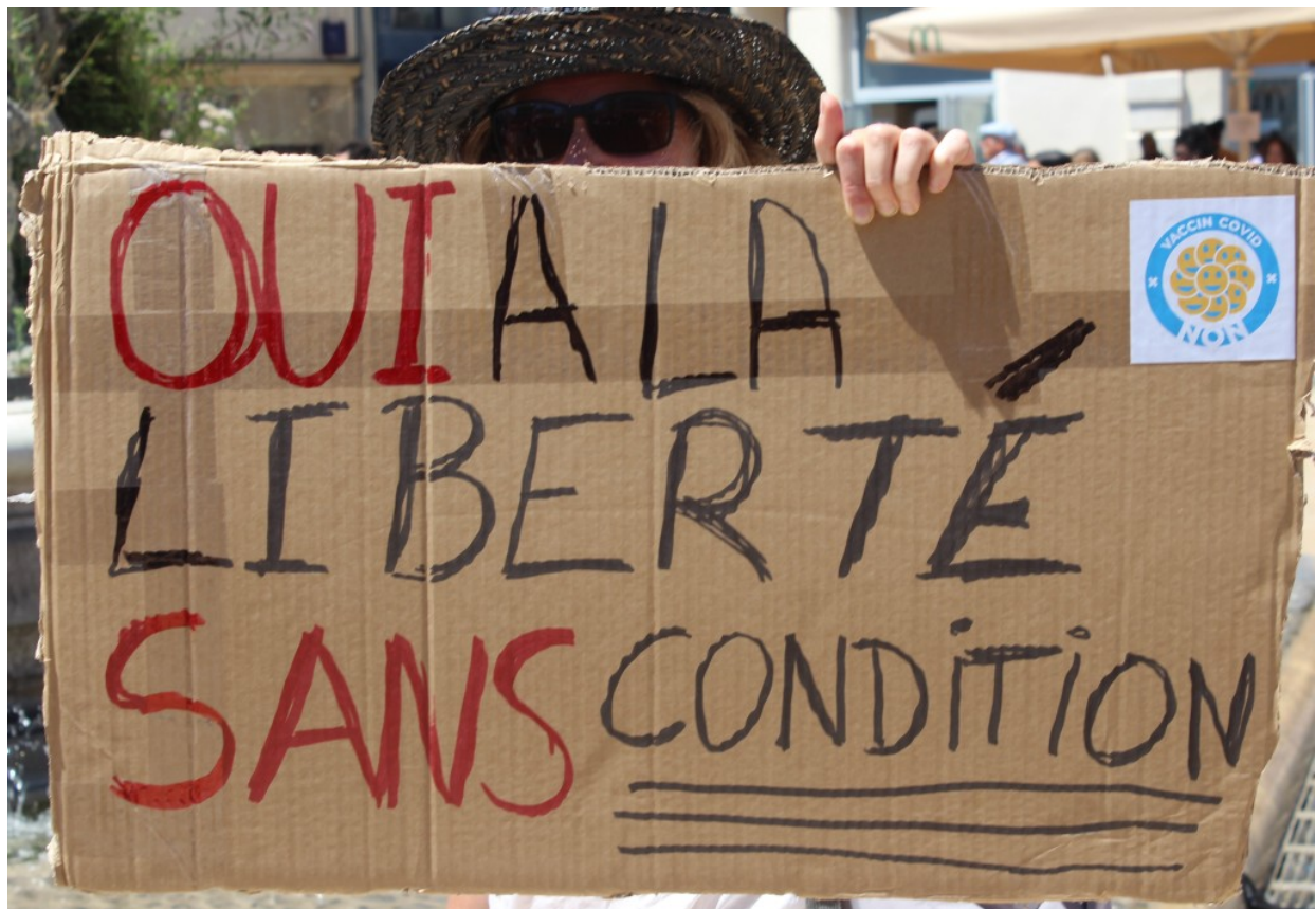
Yes to unconditional freedom