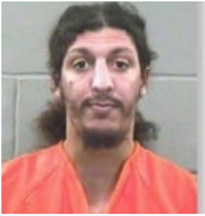
Richard Reid, hapless dupe.

testimony before the House Committee on Homeland Security. Allowing Abdulmutallab to keep the visa increased chances federal investigators would be able to get closer to apprehending the terror network he is accused of working with, “rather than simply knocking out one soldier in that effort.”